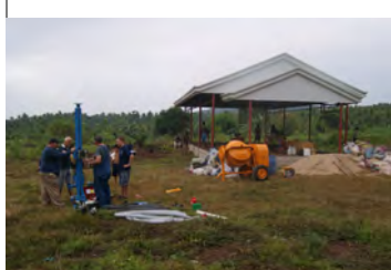
Work on Balut Island is shown here in this photo. In the foreground is the water well drilling rig with the men working. The building is in the background with ongoing work inside on the floor.