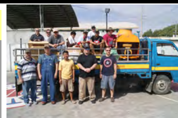
Our team of workers from the Philippines and the USA. The group of men had loaded the cargo truck with equipment and supplies headed for the ship at the pier for our work on Balut Island.