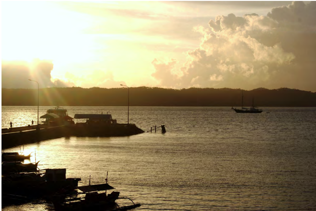
Sunrise over Sarangani Island, Philippines. The photo shows the quay of Port Maveas, Balut Island with the missionary sailing ship RIM Nativa at anchor in the distance. March 11, 2014.