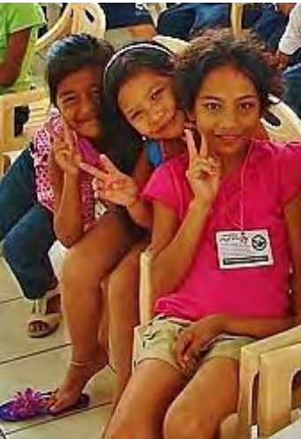
VBS kids are the same everywhere, like these who are having a really good time at Faith Baptist Church, Davao City.

The underclassmen of PMBS-AIT dressed in their formal choir attire are pictured here listening to the graduates' presentation of special music. The choir also sang songs from the year's musical presentation. These are students who will return to class in June as the new semester begins. Already we're looking for a large incoming freshman class and pray for the funding necessary to do our best job during the 2013-14 school term. Many thanks go to all who have helped us!