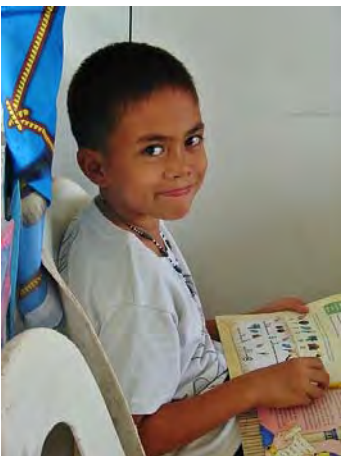
Having an opportunity to learn about the Lord in the VBS setting is seriously something to grin about!