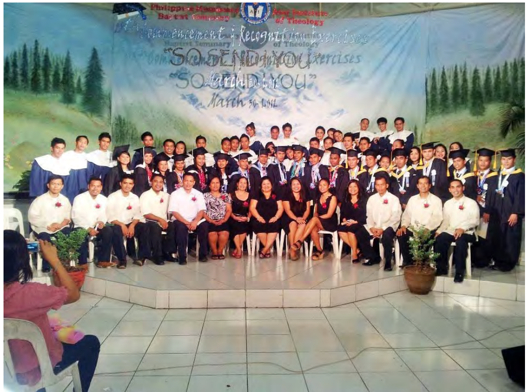
The Faculty and Staff along with our 2012 graduates of the Philippine Missionary Baptist Seminary-Asia Institute of Theology pose for the photo at the end of our 2012 Commencement at the school in Davao City, Philippines. Congratulations to all!