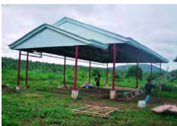
The new church house as it stands now at Port Maveas, Balut Island, Southern Philippines. This was the work that was done in March, 2012 when our boat engine failed.

"The wonder of the sea and the sky above would otherwise make problems vanish...but not now."