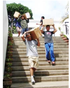
Carrying heavy loads down the long stairs at PMBS.