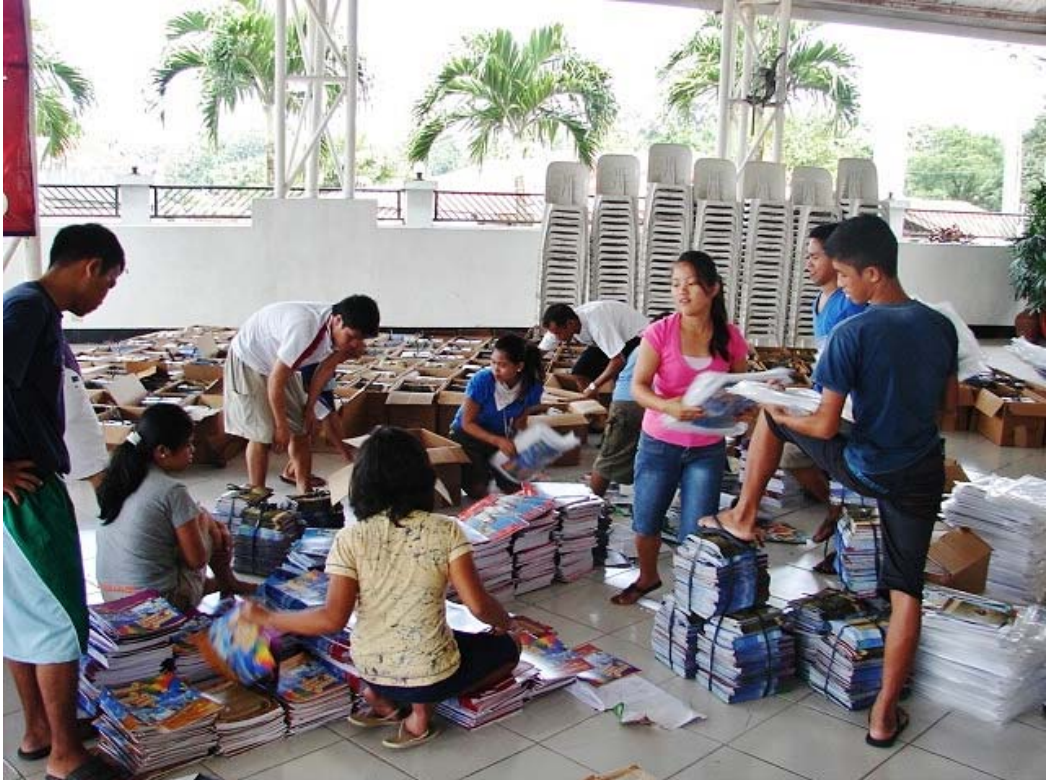
Students of Philippine Missionary Baptist Seminary-Asia Institute of Theology work together in the sanctuary of Faith Baptist Church, sorting and packing boxes of Vacation Bible School literature in preparation for our annual Bible conference later this month. Distribution of this and much more literature will be done at that time for about 300 Philippine churches.