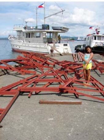
RIM Nativa and Juli at Sta. Ana Pier, February 6, 2012...loading building framework for the church on Balut Island at Port Maveas.