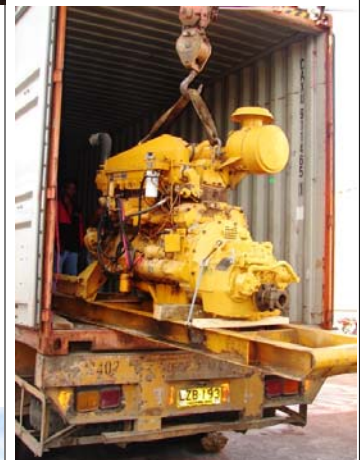
The Caterpillar marine engine with its new hydraulic transmission being unloaded from the cargo container that brought it here from the United States.

The photo at the left shows the interior part of the keel from the mid-section looking astern. This keel is being built with three vertical plates and a ten-inch wide bottom flange. It will later be filled with concrete to provide generous ballast at the hull's lowest point. The overall length of the keel in this picture is one hundred feet. It will be trimmed as the bow stem and stern step are built onto it, fore and aft. Featured in this photo are (with the hardhat) Elmer Baguio, structural manager, shipyard owner and CEO, Marfenio Tan (light yellow shirt) and that's me, comfortable behind the welding hood...love it, love it, love it!