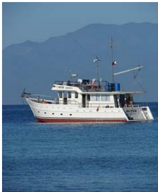
RIM Nativa Sunday morning in February off Talikud Island, Linosutan Mission, Southern Philippines.