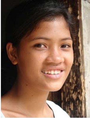
One of many teens in the church located in Barangay Lipol, Balut Island. At least three high school grads from here will attend our seminary this coming June!