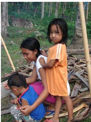
A B'laan mother and her two children prepare firewood for cooking.