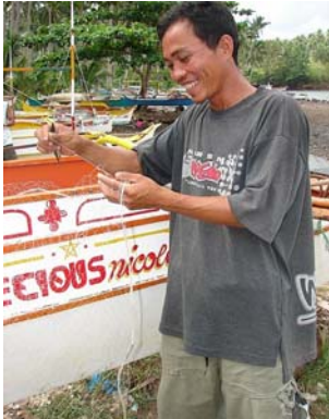
Fishing is a major industry on Balut Island. A B'laan fisherman mends his nets in preparation for another night on the sea near Lipol village.