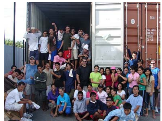
Empty containers on our PMBS parking lot always means a difficult job is finished! The Photo shows a lot of tired but happy people after offloading over 1,600 cartons of books and mission supplies by hand, one by one.

The unloading is certainly not all the work to be done, however. We set to the task of separating the books and various other supplies almost immediately. When the Conference time comes soon, everything will be ready for distribution. Even before that, the clothing and other things designated for Remote Island Ministries will have been put to use. Thank you all for your help!