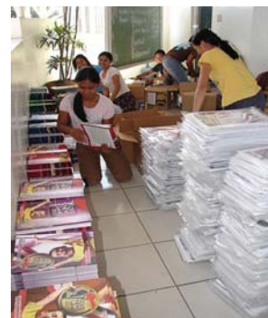
PMBS Students help with the important job of preparing Bible study materials for distribution. This is for VBS.