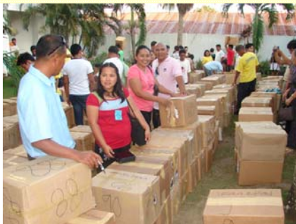
Delegates to the conference selecting their cartons of Sunday School and Vacation Bible School materials for the churches.

A lot of material remains for others to pick up now that the conference has ended. This literature distribution is based on a first-come-first-serve basis and is free for the taking. We cannot ship materials around the Islands, however because funds are limited. Typically all Sunday School and VBS materials are liquidated by the end of October to make space for new shipments.