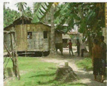
Typical houses among the Sangil in the village of Manaboy, Sarangani Island.