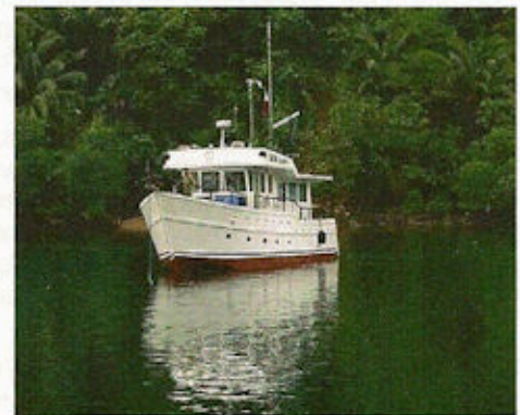
Remote Island Ministries M/Y Nativa ...resting at anchor in a beautiful lagoon at Sarangani Island, our waypoint for more distant voyaging. The village of Patuco is located here.

There are tens of thousands of people in all this area who have not heard the gospel and so few missionaries who are willing to go to them. Pray with us in this burden of ministry and please help us as we're ...reaching people on the edge!