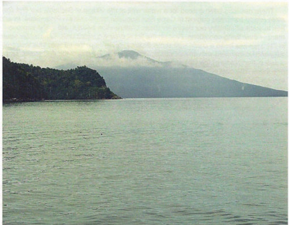
The fumaroles of nearby Balut Island, an active volcano adjacent to Sarangani Island are plainly seen in the early morning light. The October voyage of RIM Nativa surveyed the area for gospel ministry during 2010.