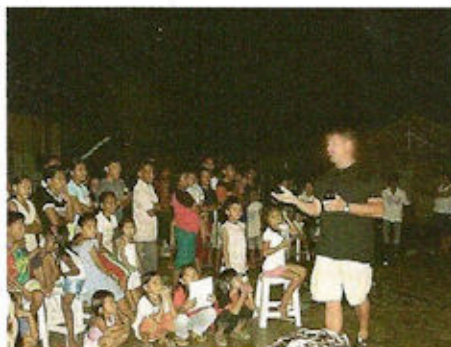
Sharing the gospel with adults and children in the village of Patuco, Sarangani I.

God has, in His infinite wisdom, called us to preach the gospel in this world. There is no higher calling. There is no greater task. There is no more urgent a time than now. The souls of mankind...more than seven-billion strong, are longing to hear the simple message of God's love. Whether in a city of millions or a village of tens...people need to hear.