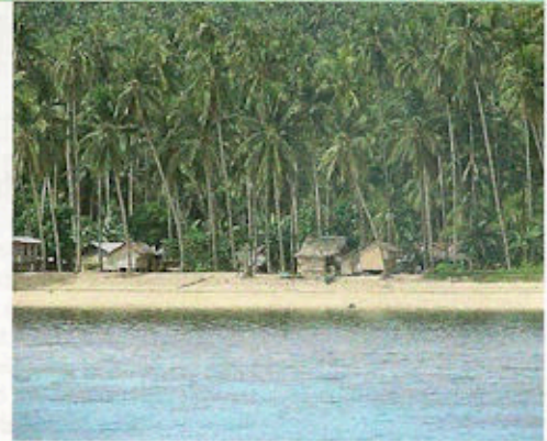
Houses of the Sangil people, the village of Manaboy, north shore of Sarangani Island.