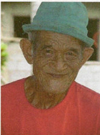
"The Green Hat"

A carpenter poses for a photo at Lavigan Anchorage, October 2009