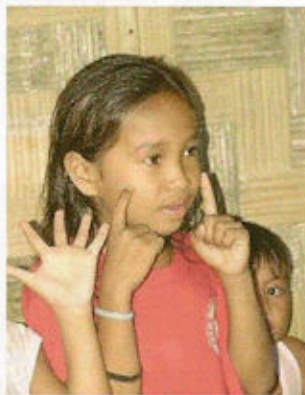
A child in Patuco learns a song about Jesus. This village holds much promise for planting a church.